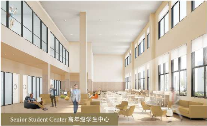
Senior Student Center 高年级学生中心