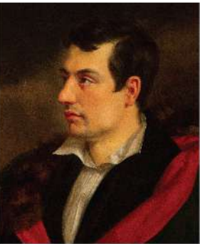
GEORGE GORDON BYRON 乔治·戈登·拜伦