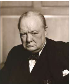
WINSTON CHURCHILL 温斯顿·丘吉尔