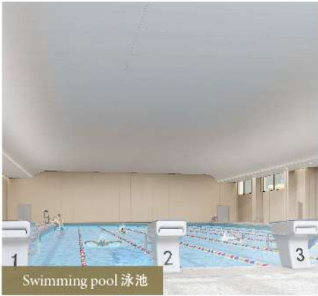
Swimming pool 泳池