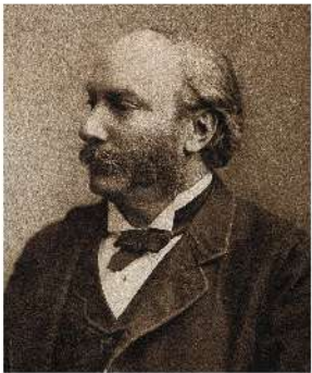
LORD RAYLEIGH 诺贝尔物理学奖 瑞利男爵