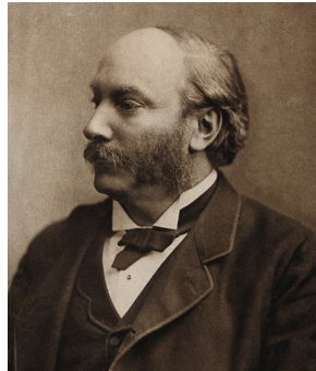
LORD RAYLEIGH 诺贝尔物理学奖 瑞利男爵