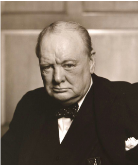
WINSTON CHURCHILL 温斯顿·丘吉尔