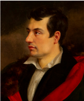
GEORGE GORDON BYRON 乔治·戈登·拜伦