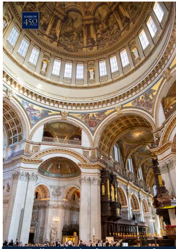
Follow in the footsteps of the Giants of old.