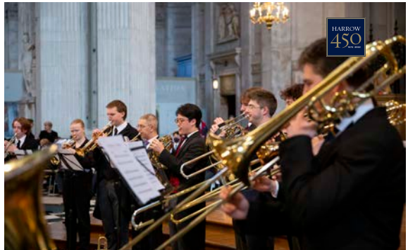
Championing our present successes.