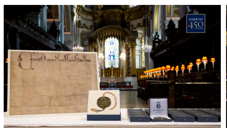
Celebrate our long and venerable past.