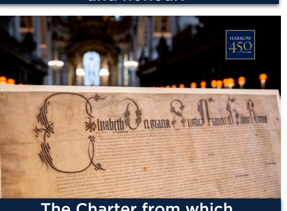
The Charter from which it all began.