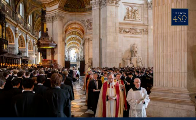
'Follow up! Follow up! Follow up!'