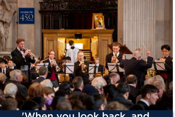
'When you look back, and forgetfully wonder.'