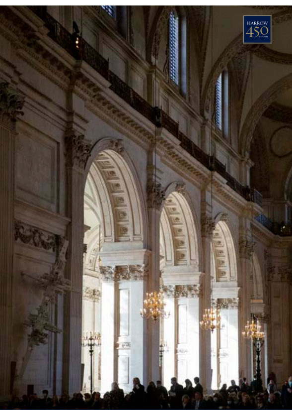
Delighting in nostalgia.

Our Harrow songs have lifted the spirits of many generations.