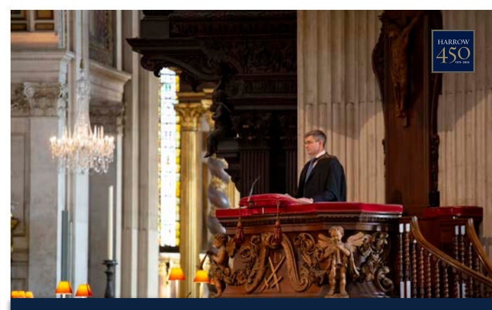
Inspiring the next generation.