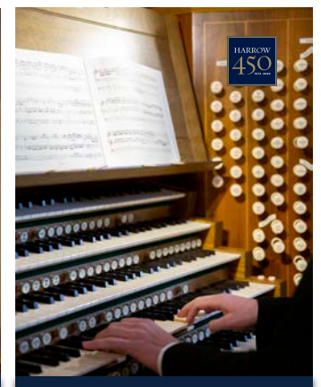
Music played by lions.