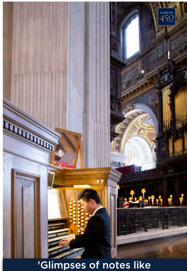
the catch of a song.'