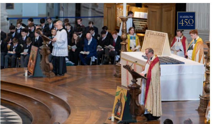
Providing an abiding legacy for the years ahead.